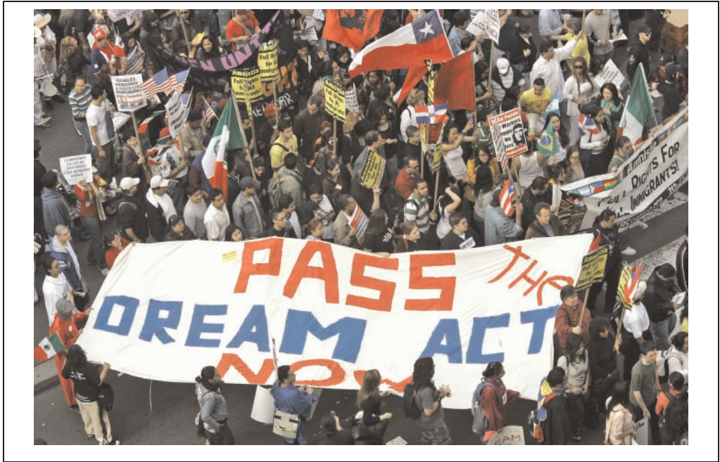
Illustration 9. Mass march for the Dream Act, which would provide pathways to citizenship for undocumented immigrant college students; Union Square, New York City, May 1, 2007. Many demonstrations in support of the Dream Act have taken place across the country.

However, he still has no path to legal status and citizenship.