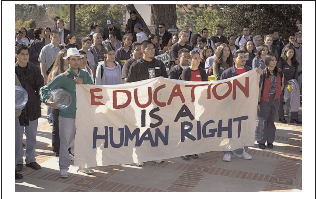
Illustration 7. January, 2002, outside a University of California regents meeting at UCLA, about 300 students rally for making undocumented students who graduate from California high schools eligible for in-state tuition.