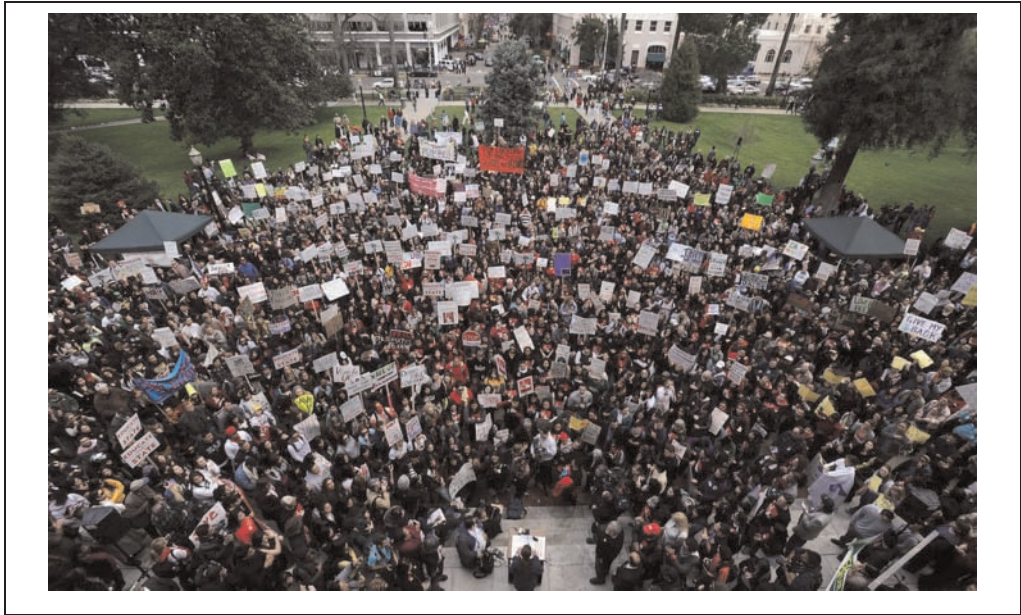
Illustration 8. Students, teachers, and supporters rallied against cuts to public education funding at the Capitol plaza in Sacramento, California on March 4, 2010. The rally brought together proponents of K–12 schools, community colleges, California State universities, and the University of California system. The action was one of many marches, strikes, teach-ins, and walkouts planned for a National Day of Action for Public Education.

The earliest versions were introduced in the U.S. Senate in 2002 and 2003, when it was approved by the Senate Judiciary Committee but not brought to a full vote.