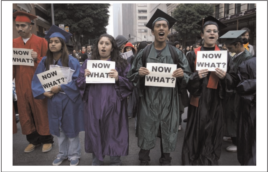
Illustration 5. Undocumented high school and college students, displaying signs asking “Now What?” rally in downtown Los Angeles, November 7, 2007. Because the Supreme Court ruled in 1982 that school districts cannot exclude undocumented immigrant children from K–12 education, a growing number of undocumented youth are now graduating from high school. These students are unable to work legally and find it difficult to continue their education.