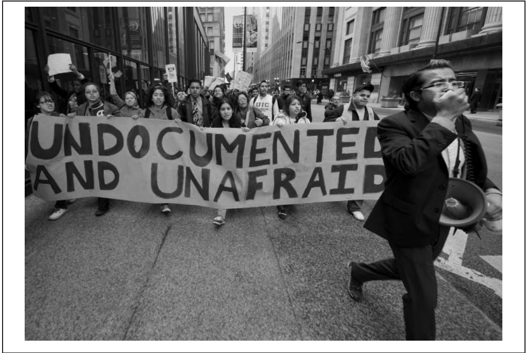
Illustration 6. Members and supporters of Immigrant Youth Justice League marching in Chicago, in March 2010, hold a sign reading “Undocumented and Unafraid.” The IYJL, which started at the University of Illinois-Chicago, has brought together students from eight Chicago area colleges and universities to fight for the federal Dream Act and against deportations. One focus of the organization has been to encourage undocumented students to “come out” by declaring their status publicly.