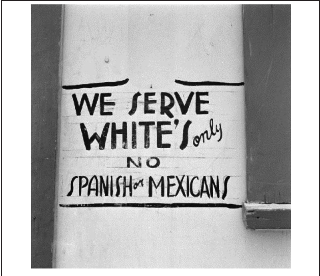
Illustration 2. Sign c. 1949, Dimmit County, Texas, illustrates the widespread practice of de facto segregation in the Southwest. The counterposing of “White’s” [sic] against both “Spanish” and “Mexican” indicates that Anglos rejected Mexican American claims to whiteness through self-designation as Spanish.